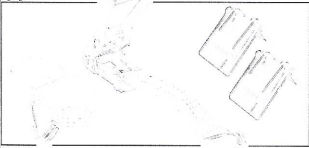
CTM 24170 RATCHET STRAPS AND ACCESSORIES